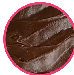
Chocolate Bavarian Creme